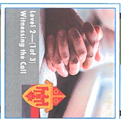
Level 2—(1 of 3) Witnessing the Call